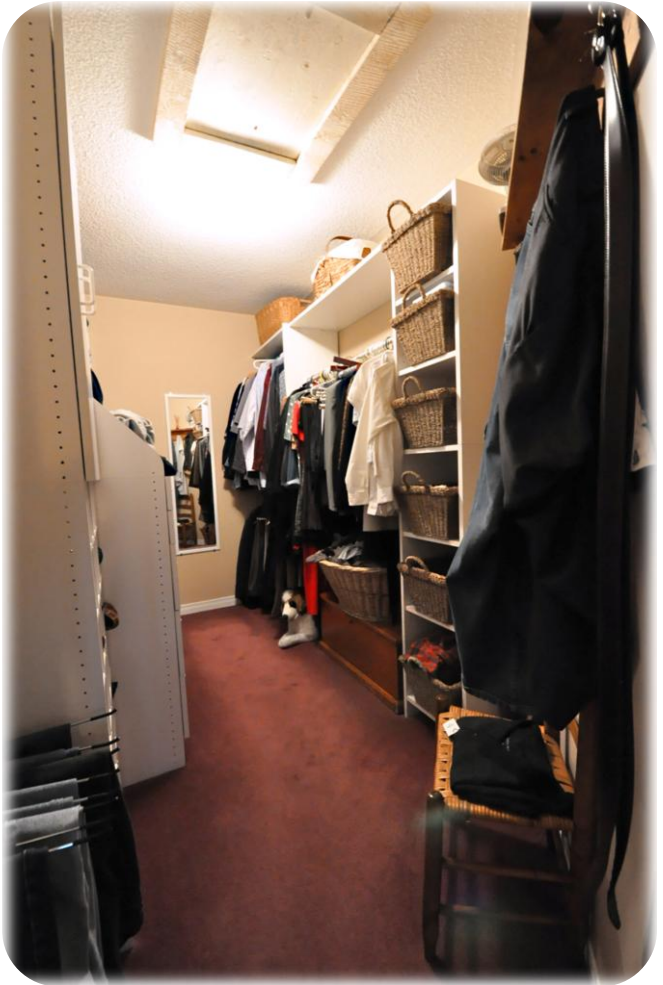
Master Walk-in Closet